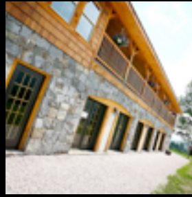
The Amee Farm