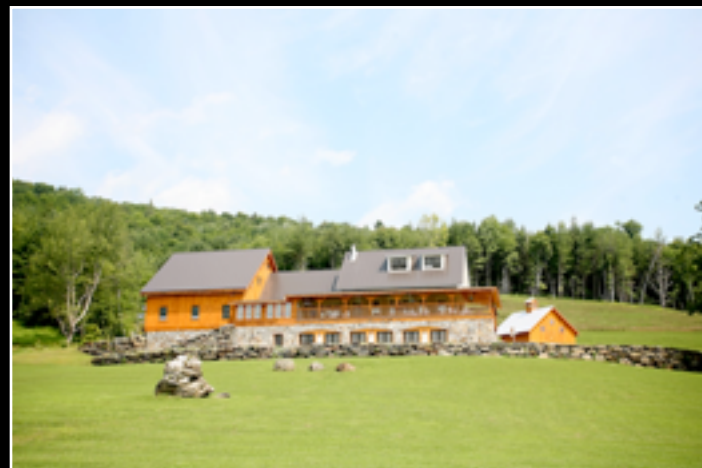
The Amee Farm

Recreation: golf, guided hikes, scenic tours, fitness retreats, spa, tennis, mountain biking, stables, kayaking, fishing, paintball, cross-country skiing, hot air balloon rides, guided snowmobile tours, snowshoeing, snow tubing, downhill skiing, snowboarding and sleigh rides