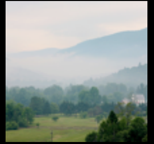
Views from the porch