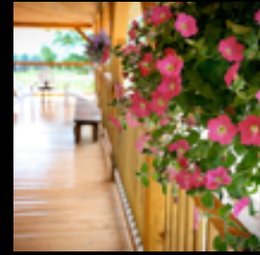
Wrap around porch